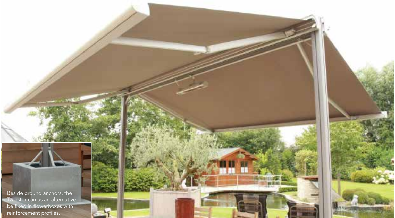
Beside ground anchors, the Twinstor can as an alternative be fixed in flowerboxes with reinforcement profiles.