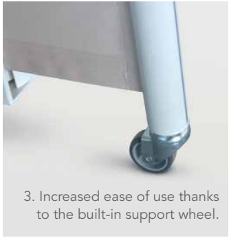
3. Increased ease of use thanks to the built-in support wheel.