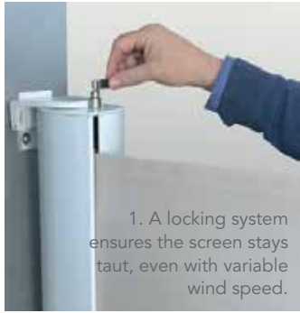
1. A locking system ensures the screen stays taut, even with variable wind speed.