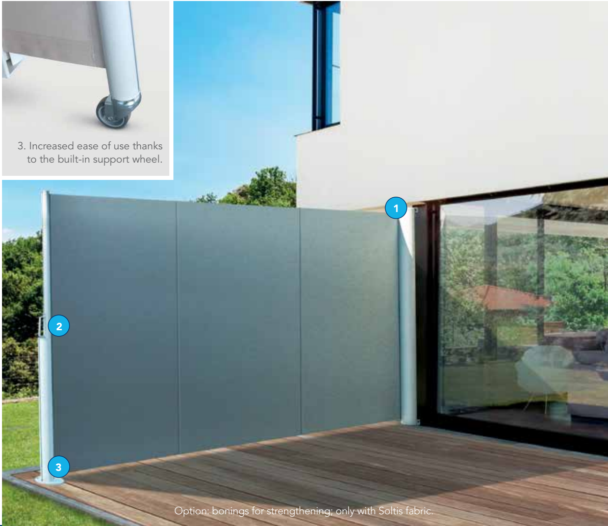
Option: bonings for strengthening; only with Soltis fabric.