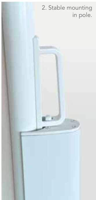
2. Stable mounting in pole.