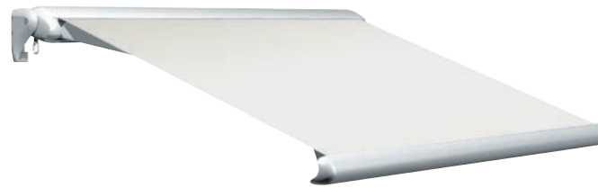
Wall & ceiling mounting options

The unique folding arm design means that the awning does not require any posts or frames and therefore keeps the area below completely free from obstruction. The awning provides complete coverage, and when not use retracts neatly back into an enclosed cassette which protects and prolongs the fabric life.